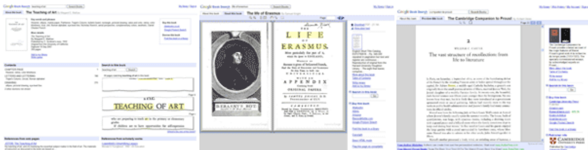
Snippet view of in-copyright book

For Library Project books that are out of copyright, however, you can read and download the entire book.